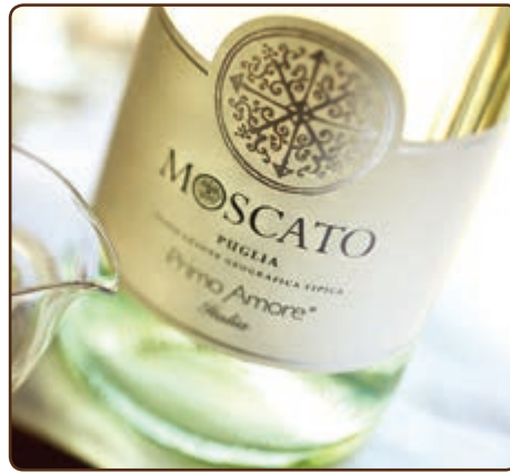
Moscato Primo Amore, Italy 9.75 glass 22.00 bottle