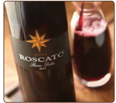
Sweet Red Roscato Rosso Dolce, Italy 10.00 glass 22.00 bottle