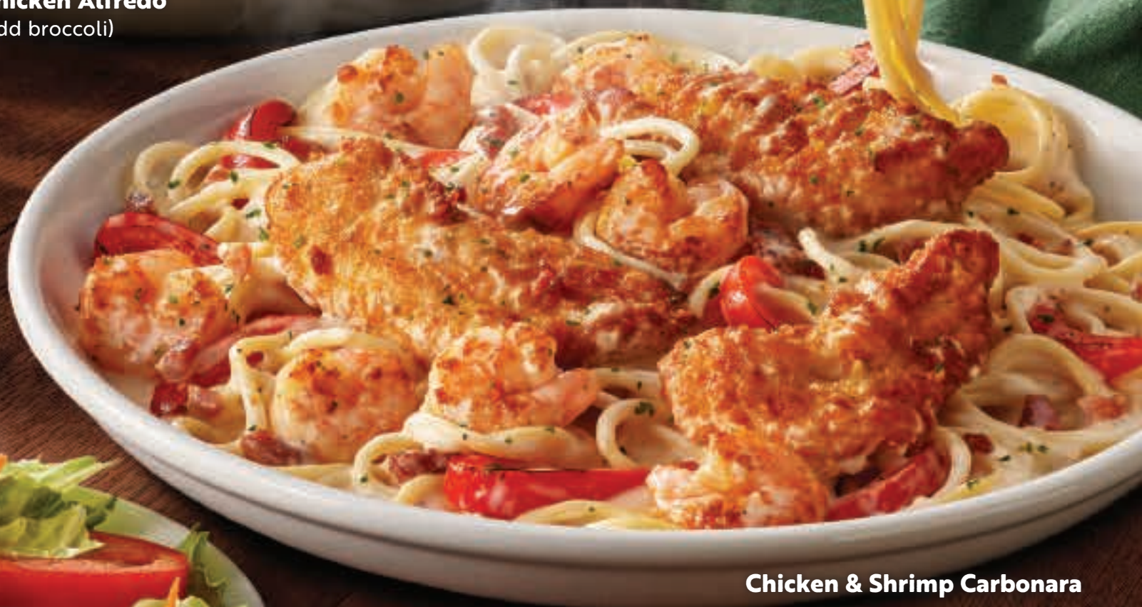
Chicken & Shrimp Carbonara