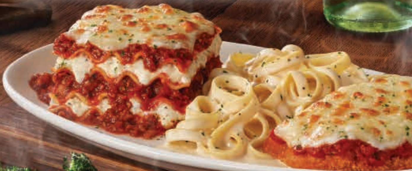
Tour of Italy