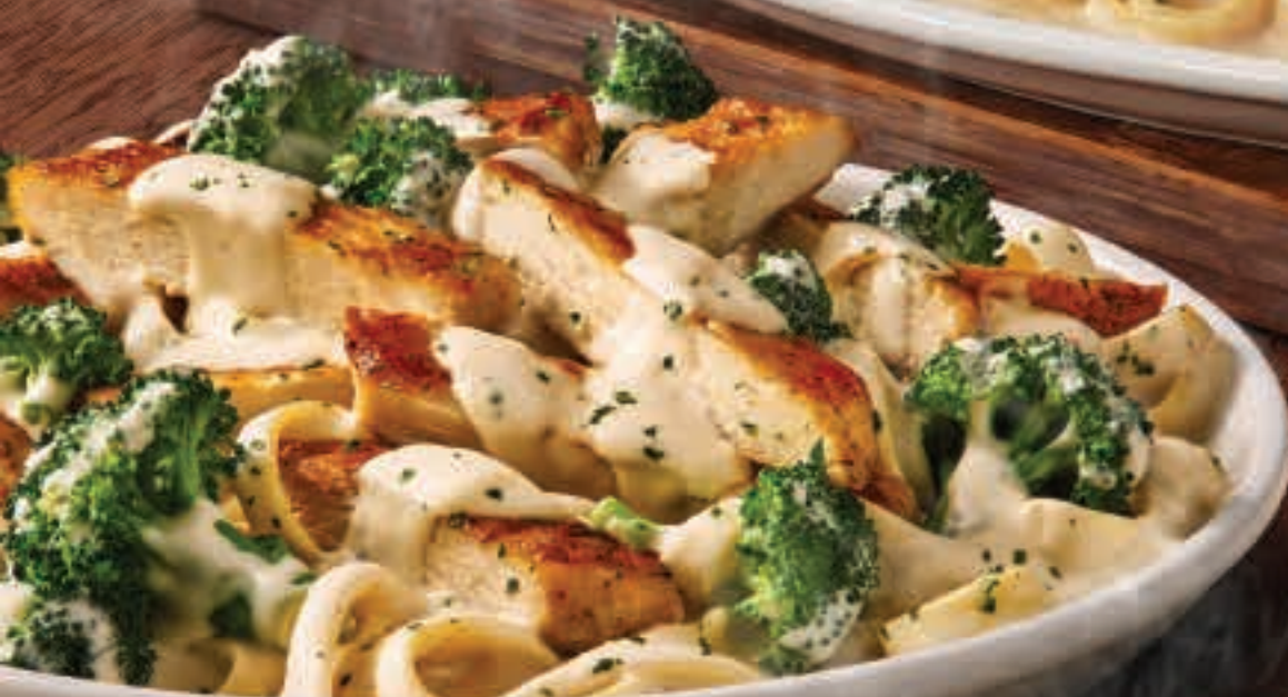
Chicken Alfredo (add broccoli)